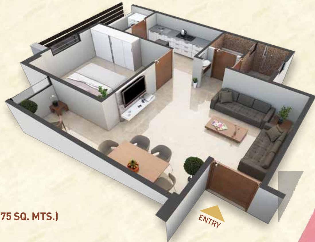
▶ 1 BHK TYPE-A 740 SQ. FT. (68.75 SQ. MTS.)