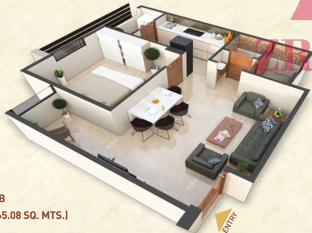
▶ 1 BHK TYPE-B 700 SQ. FT. (65.08 SQ. MTS.)