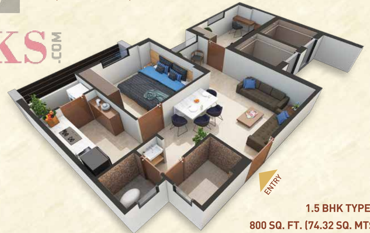
1.5 BHK TYPE-C 800 SQ. FT. (74.32 SQ. MTS.)