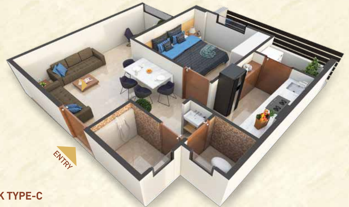
▶ 1 BHK TYPE-C 675 SQ. FT. (62.71 SQ. MTS.)