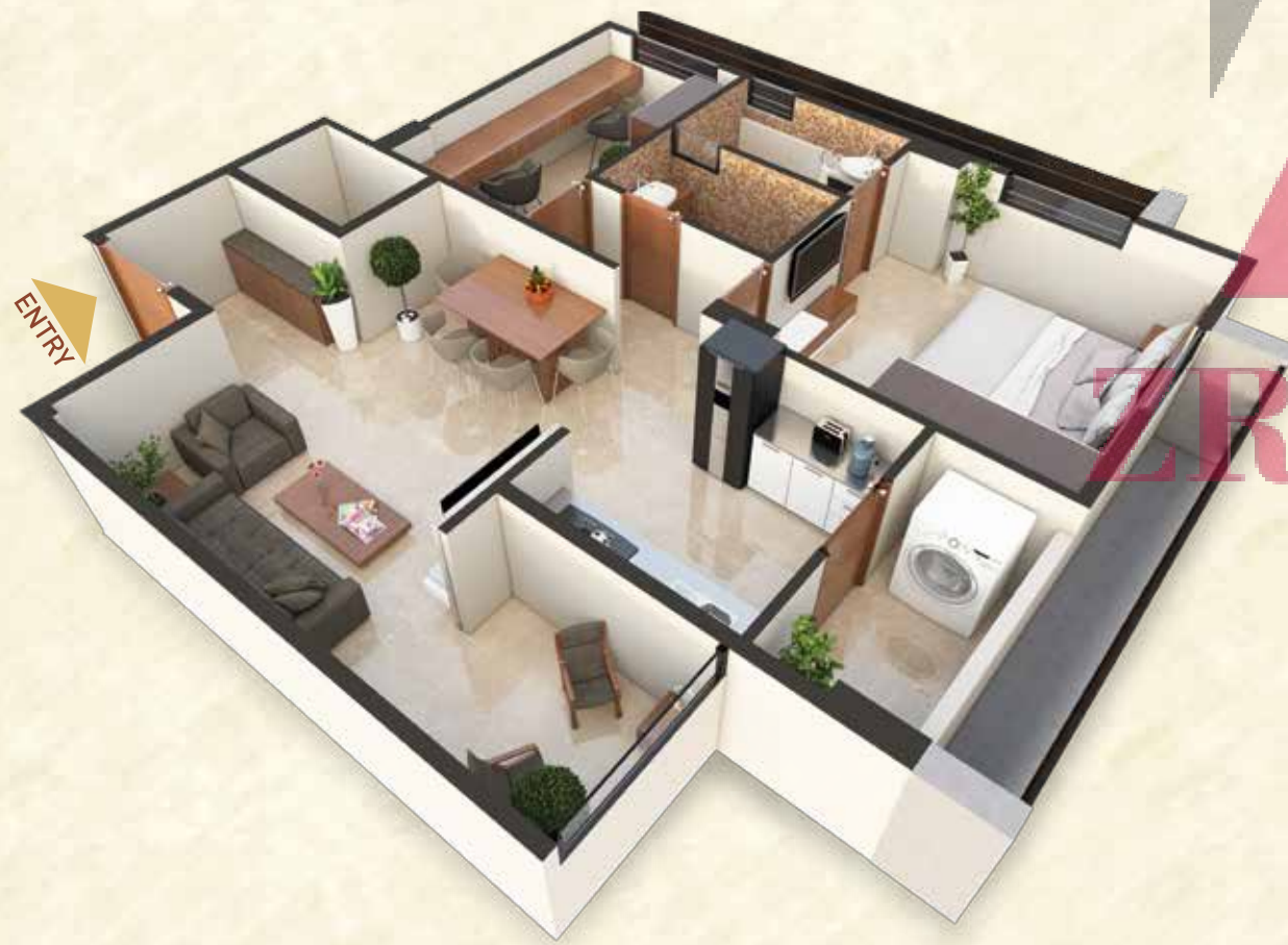
1.5 BHK TYPE-A 870 SQ. FT. (80.82 SQ. MTS.)