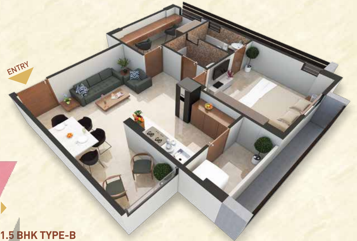
1.5 BHK TYPE-B 830 SQ. FT. (77.11 SQ. MTS.)

Efficiently designed and aesthetically appealing homes, Shaunak offers value for money while taking care of all your needs and comforts.