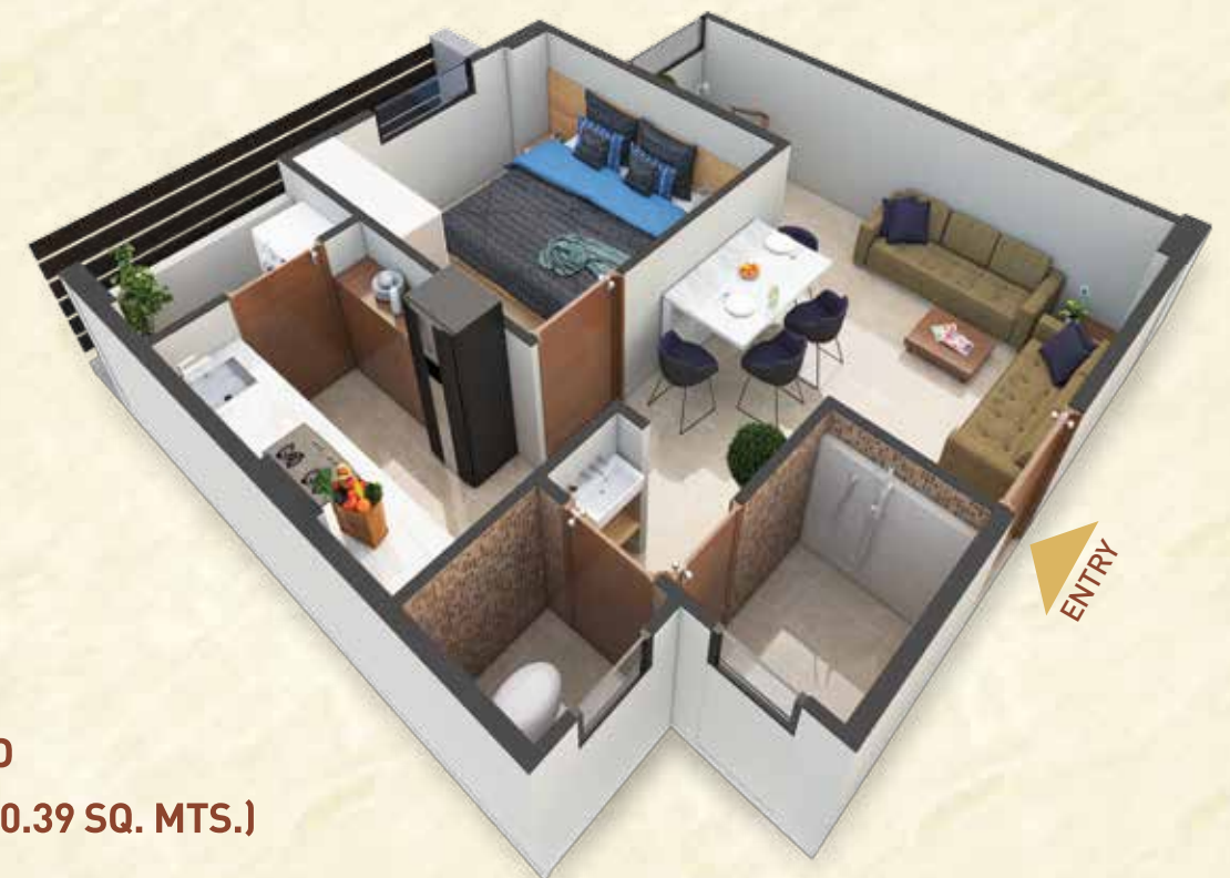
▶ 1 BHK TYPE-D 650 SQ. FT. (60.39 SQ. MTS.)